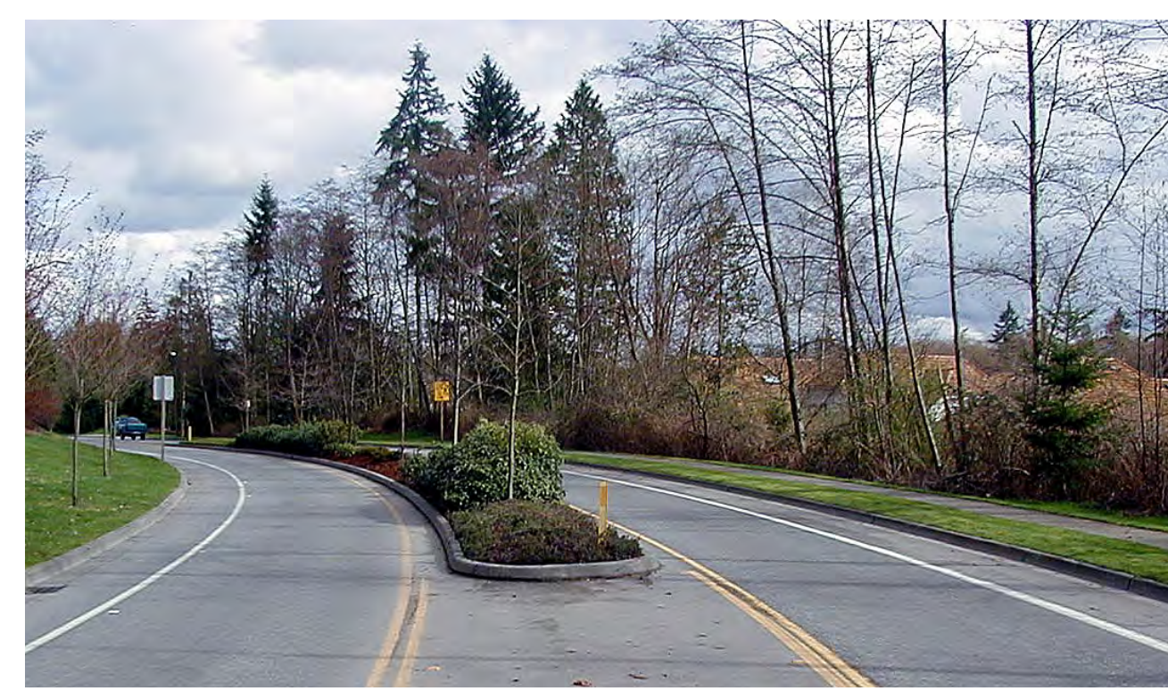
Splitter w/rounded curb (css.org)