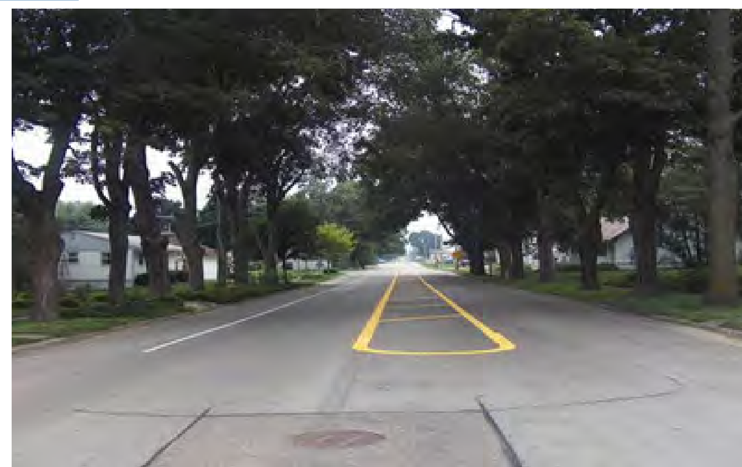
Low-Cost Painted Median