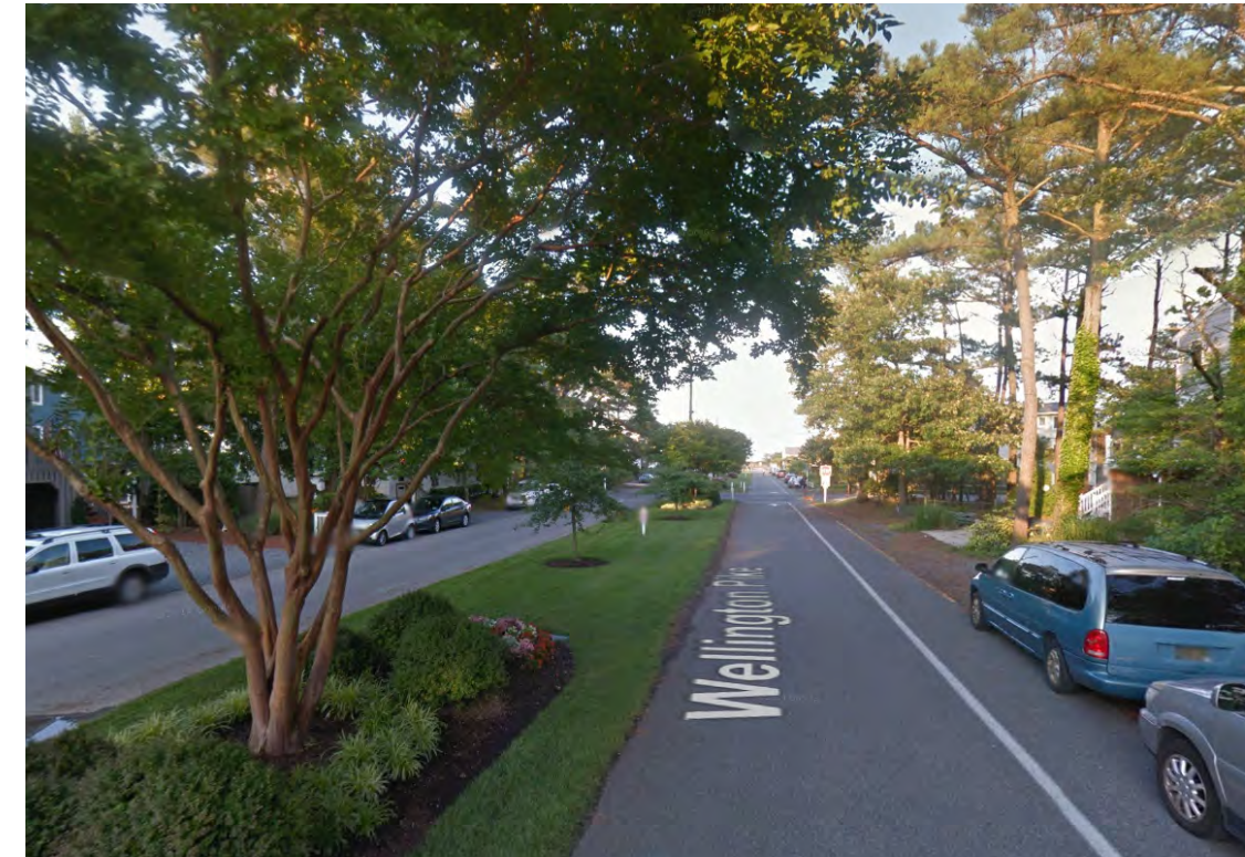
Splitter w/o curb (Google Earth)