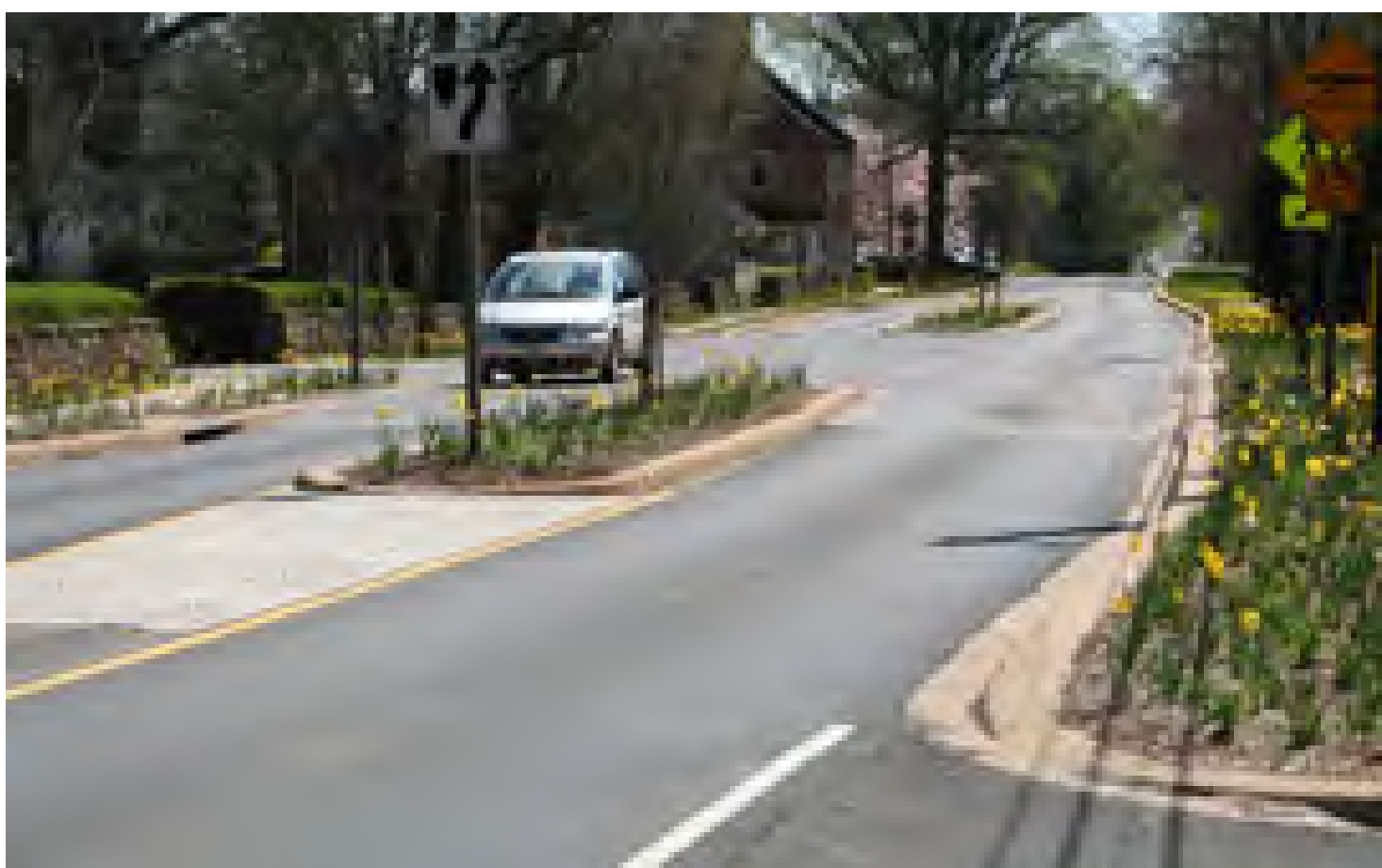
Median with crossover