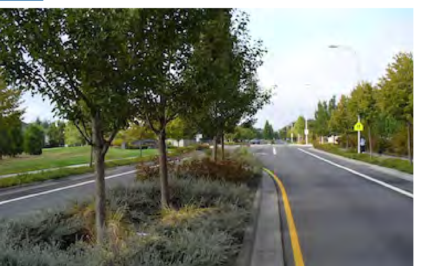
Median w/ trees/shrubs