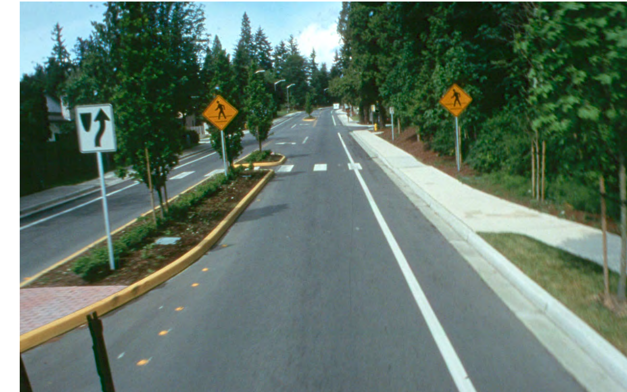
Splitter with curb in island and pavers