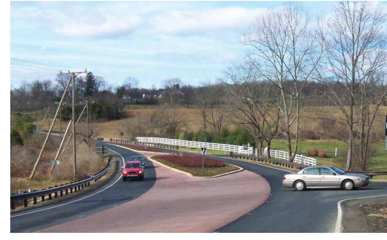
Splitter with pavers at intersection