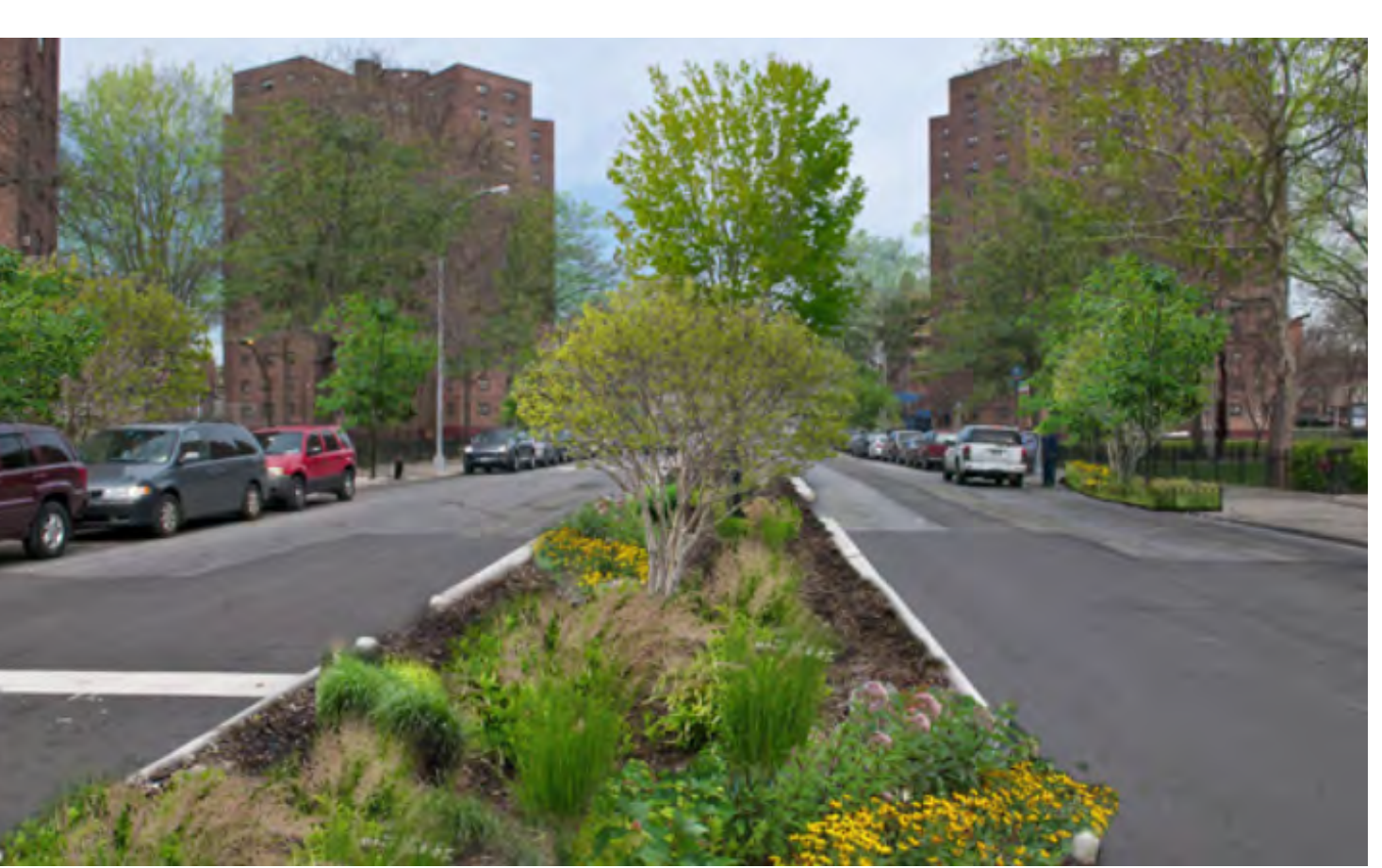
Median w/ trees/shrubs