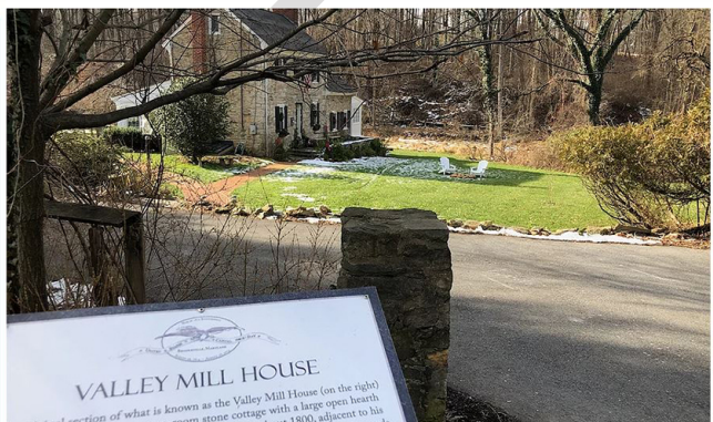
Valley Mill House, Brookeville, MD